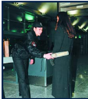
U.S. & International Airports