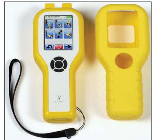
An optional silicon rubber sleeve is available to provide effective protection for the tester

SIMPLE DATA LOGGING is provided by this powerful breath alcohol tester.